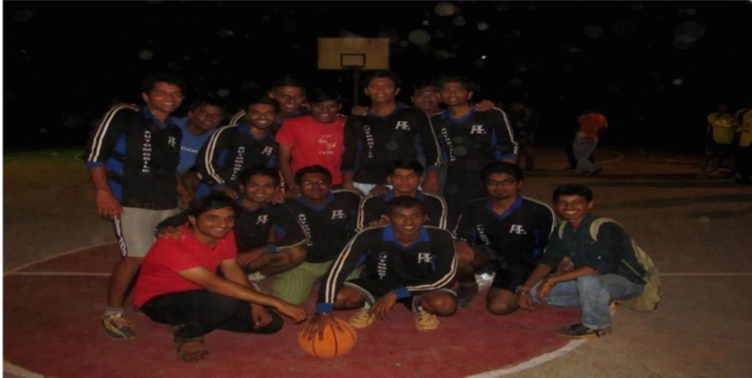
Measurement (110x63 m)